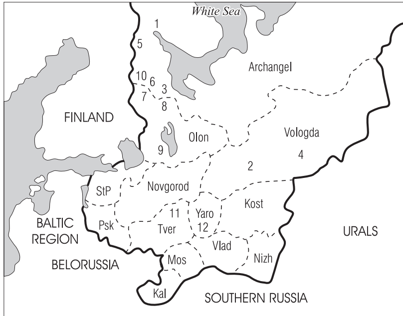
Figure 1: Location of the local communities studied in Northern Russia*

* The division of the area into provinces corresponds to the situation around 1900. The sample representing Kostroma is not marked on the map. The nationality of the community is mentioned whenever it is not a question of ethnic Russians.